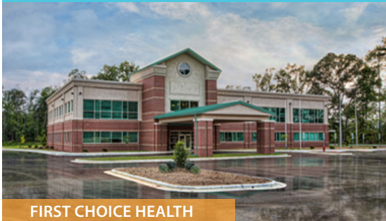
FIRST CHOICE HEALTH

First Choice Health opened in August 2012 and holds a 32,000-sf non-profit organization providing affordable medical services to the community. The East Carolina School of Dental Medicine will have its newest satellite location within the Science and Technology Campus.