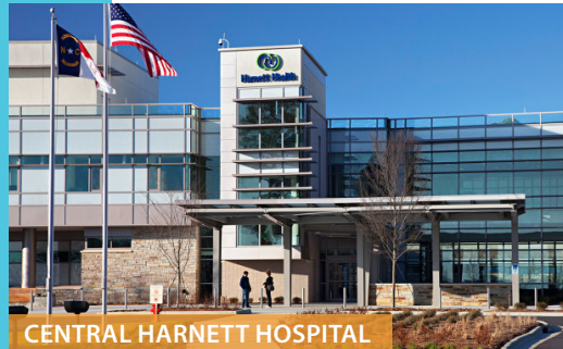
CENTRAL HARNETT HOSPITAL