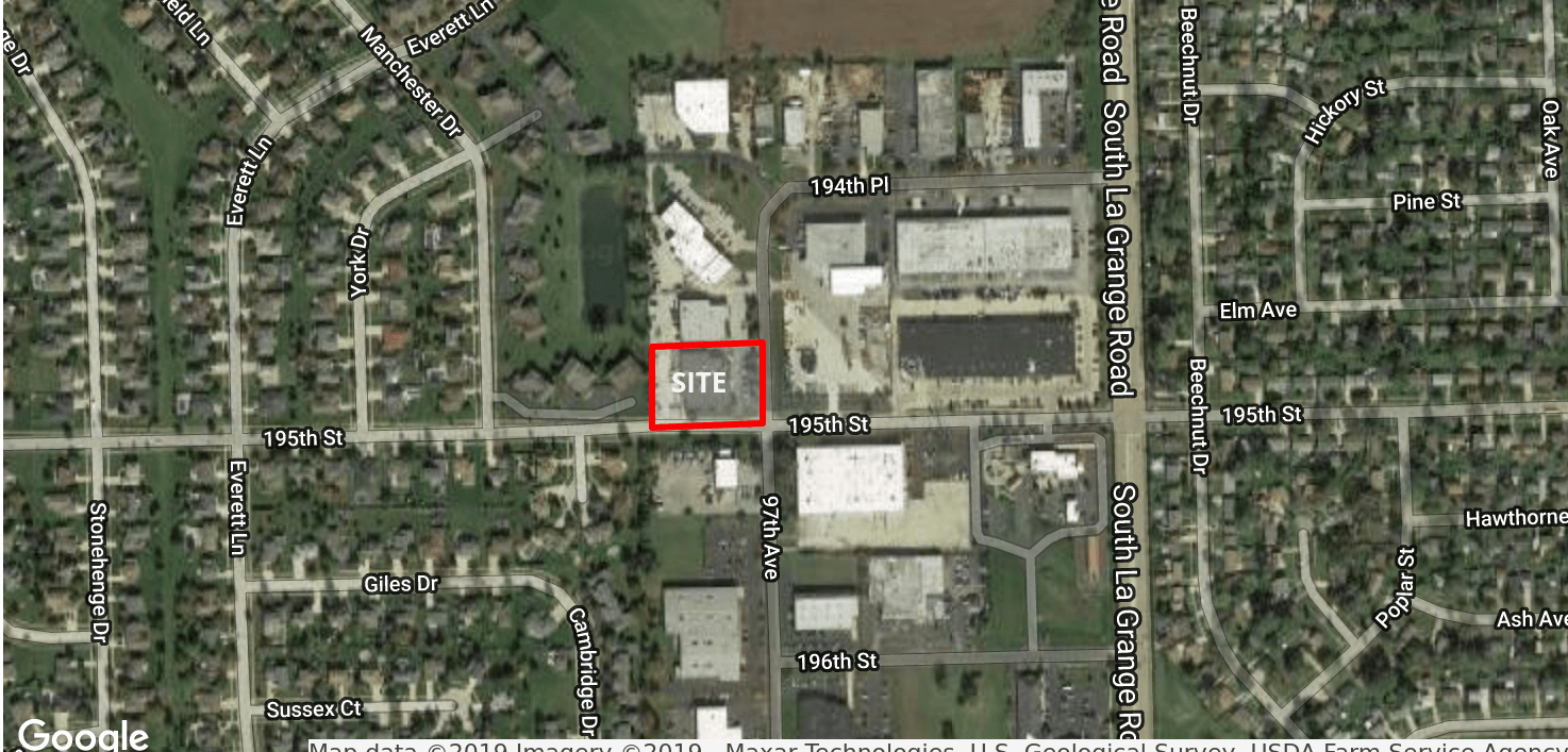
Map data ©2019 Imagery ©2019 , Maxar Technologies, U.S. Geological Survey, USDA Farm Service Agency