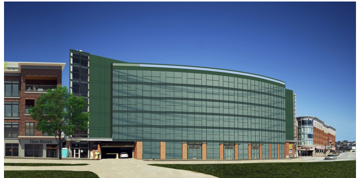
Ocean Gateway Garage - Proposal Portland, Maine