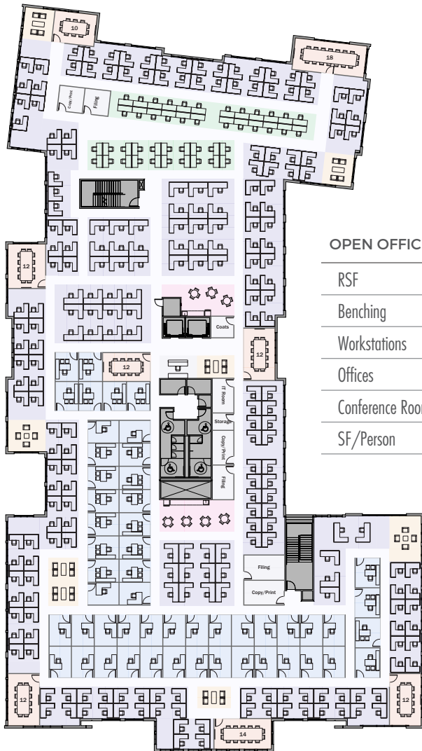
OPEN OFFICE TEST FIT