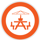
Outdoor Plazas & Community Spaces