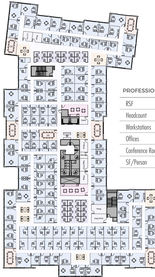
PROFESSIONAL OFFICE TEST FIT