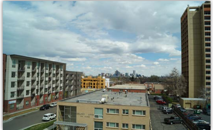
PANORAMIC DOWNTOWN & MOUNTAIN VIEWS