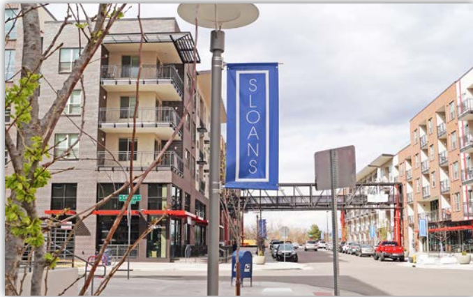
SLOANS NEIGHBORHOOD DEVELOPMENT Walkable amenities & housing for car free living