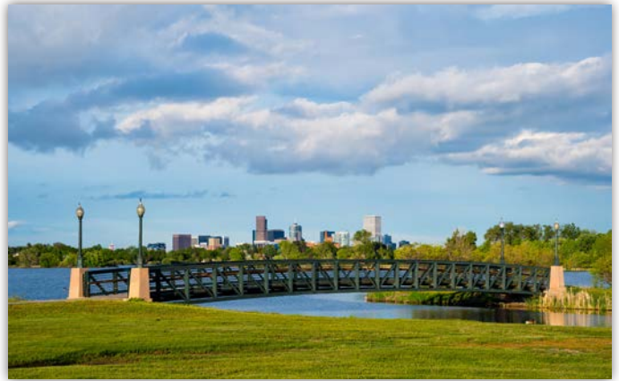
SLOANS LAKE PARK Direct access to scenic trails and picnic areas