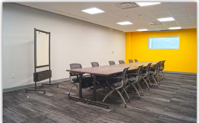
BUILDING CONFERENCE ROOM Large conference seats 12+

W. Ryan Stout 303.813.6448 ryan.stout@cushwake.com