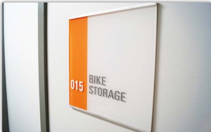
BIKE STORAGE Safe storage for bike commuters