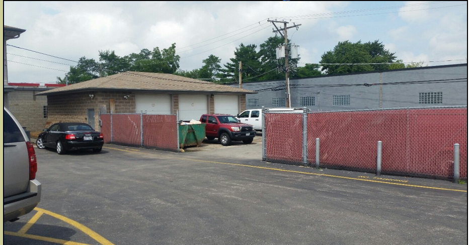
Fenced Outside Parking