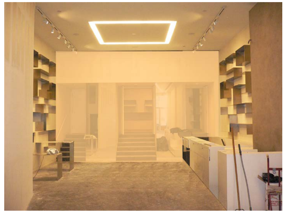
Ground Floor interior