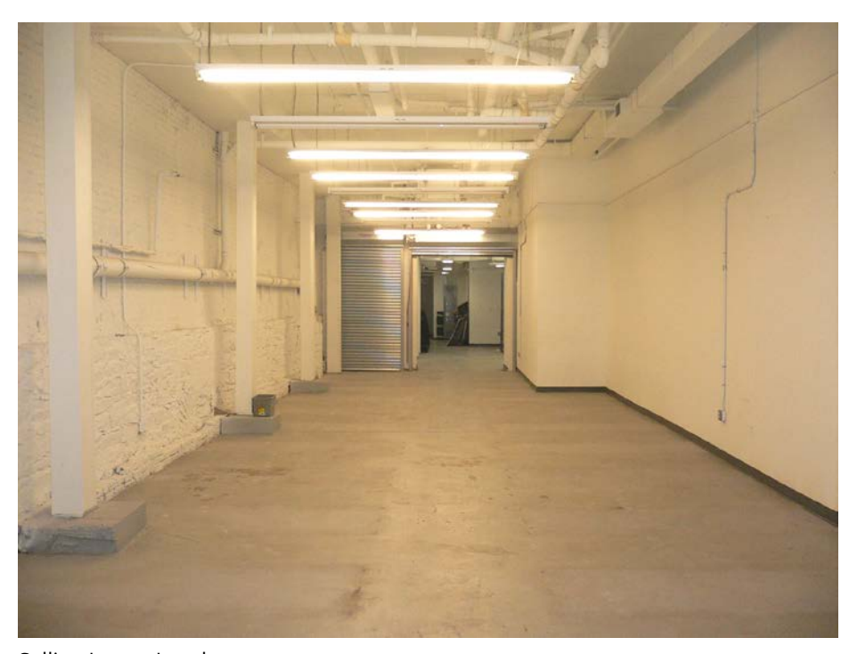
Selling Lower Level