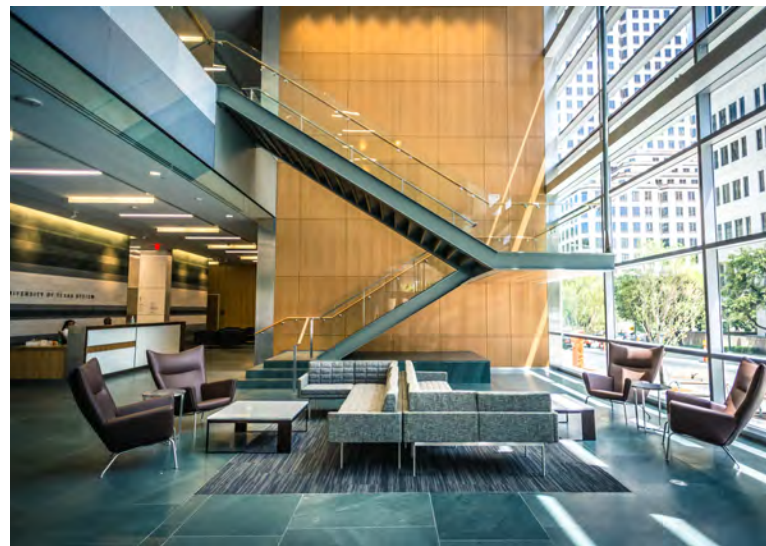
Top, left, right: Fitness center, exterior, lobby