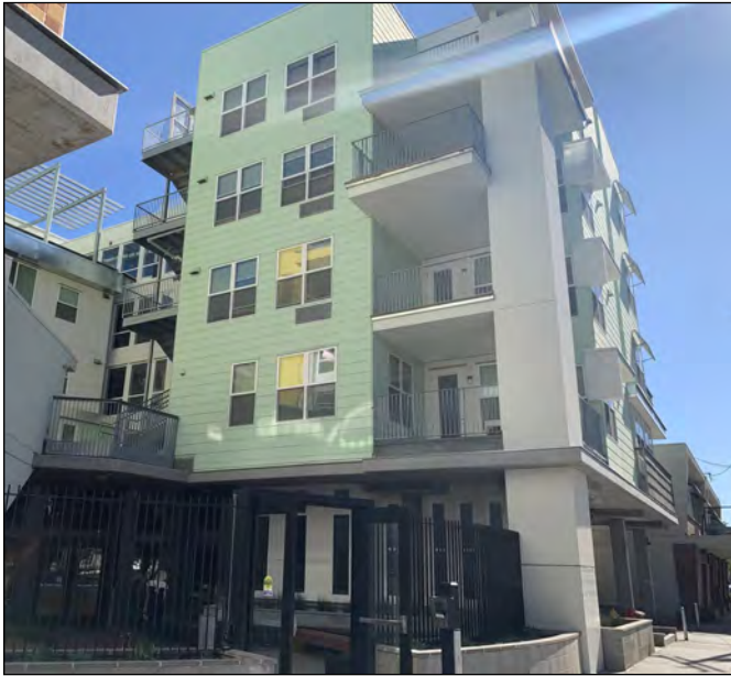
Residential Lobby to the Left of Unit