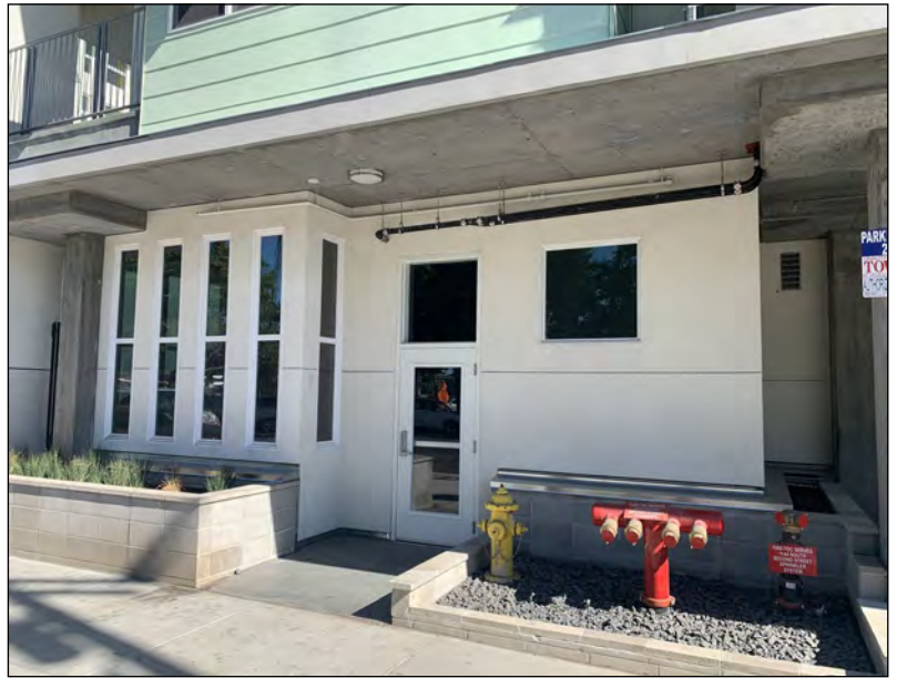
Unit Entry, with Parking Entrance to the Right