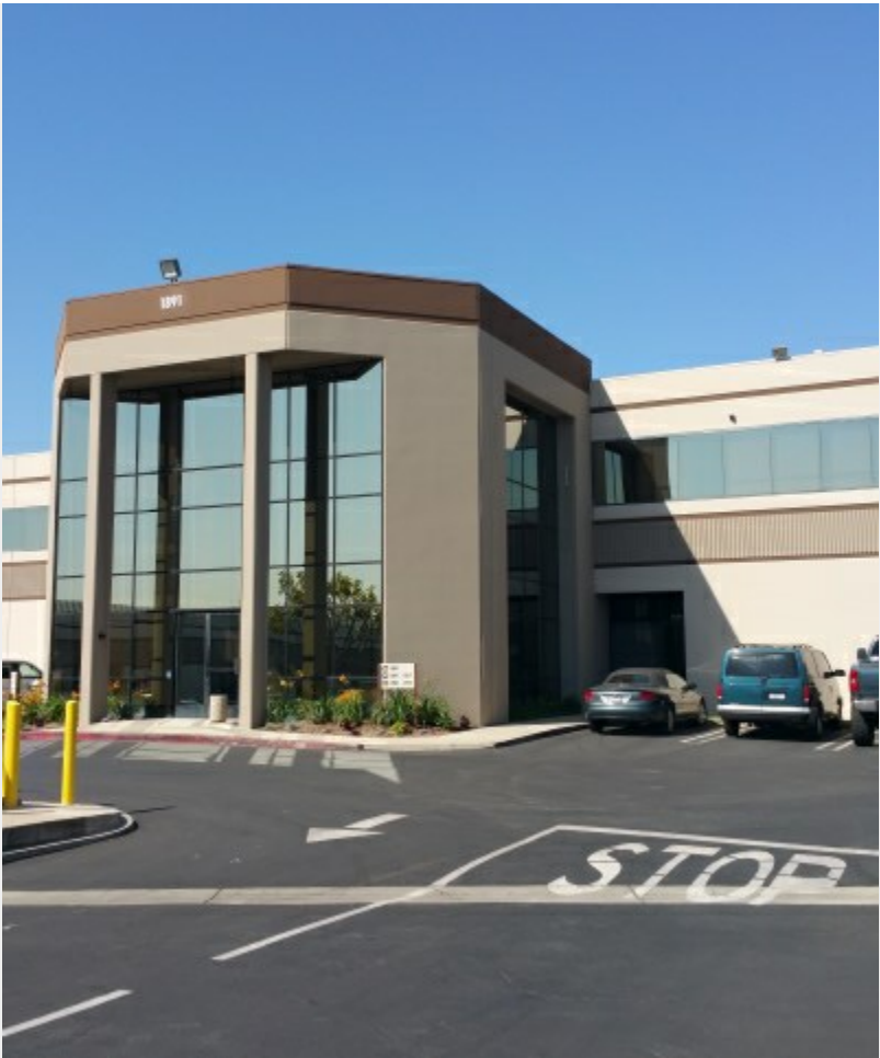
Lobby and Upstairs Office Suites