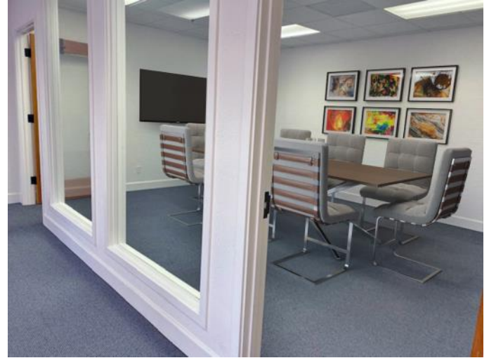
Large Office (Designed to Split)