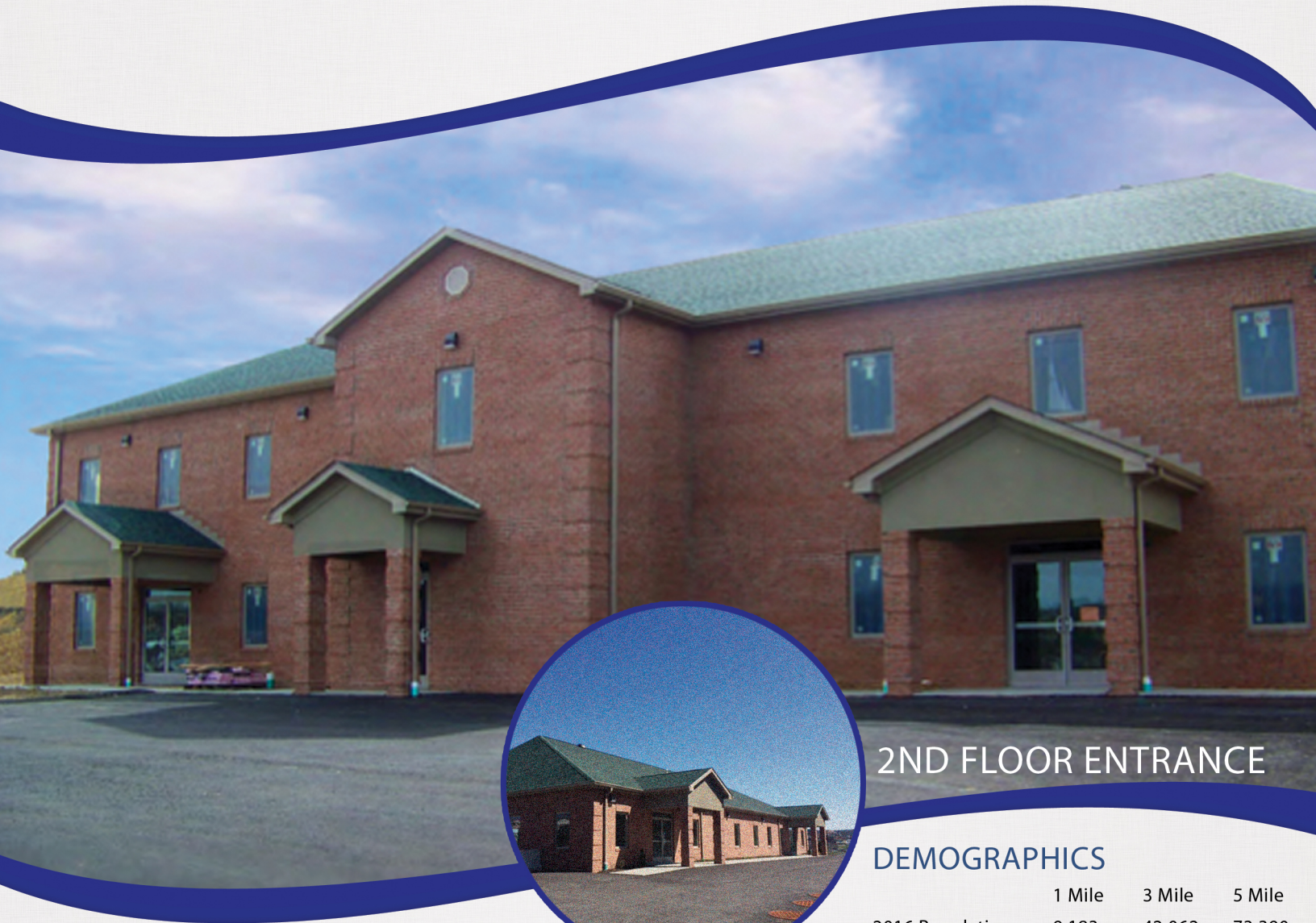
2ND FLOOR ENTRANCE