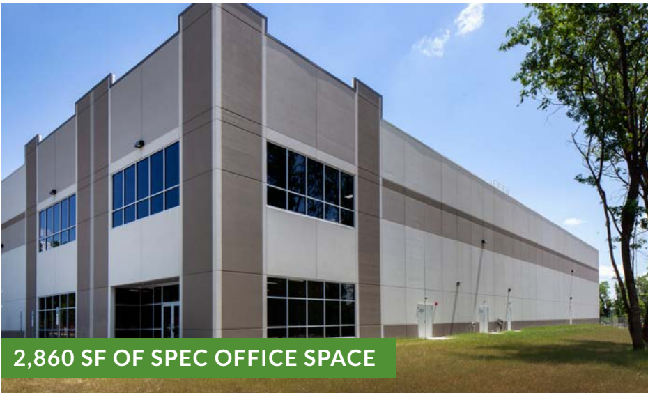
2,860 SF OF SPEC OFFICE SPACE