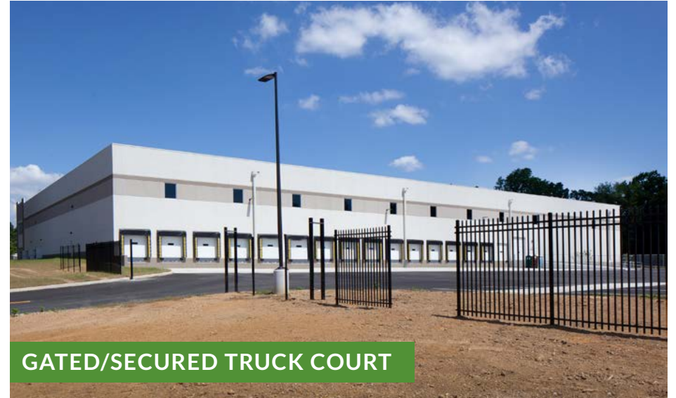
GATED/SECURED TRUCK COURT