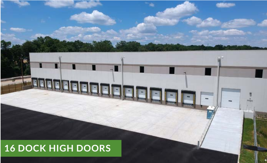
16 DOCK HIGH DOORS