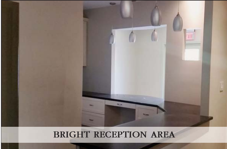
BRIGHT RECEPTION AREA