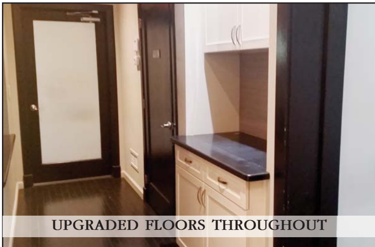
UPGRADED FLOORS THROUGHOUT