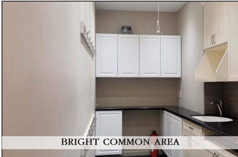
BRIGHT COMMON AREA