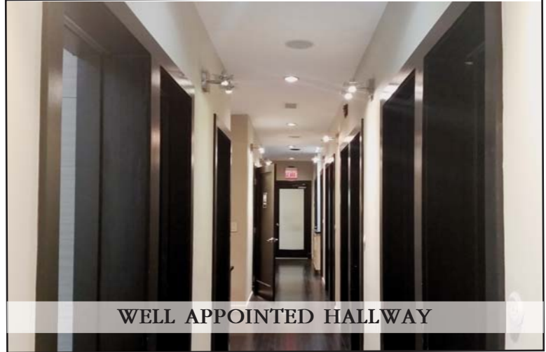
WELL APPOINTED HALLWAY