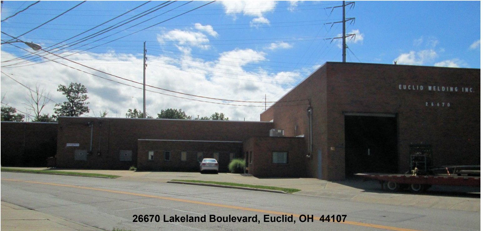
26670 Lakeland Boulevard, Euclid, OH 44107