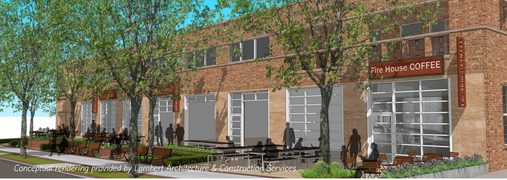
Conceptual rendering provided by Lambert Architecture & Construction Services