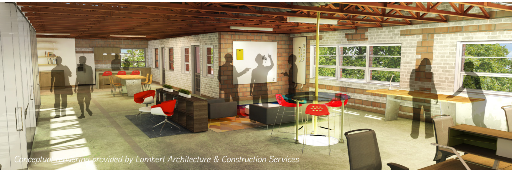
Conceptual rendering provided by Lambert Architecture & Construction Services