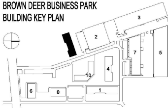
BROWN DEER BUSINESS PARK BUILDING KEY PLAN