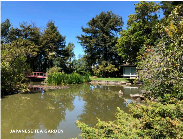
JAPANESE TEA GARDEN