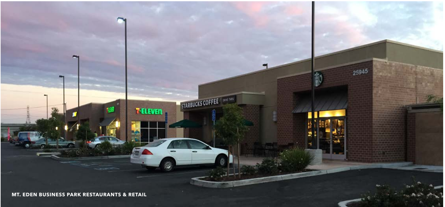
MT. EDEN BUSINESS PARK RESTAURANTS & RETAIL