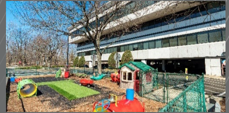
On-site day care