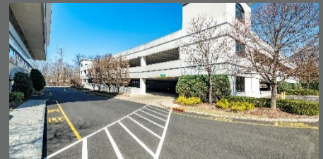
Covered parking deck