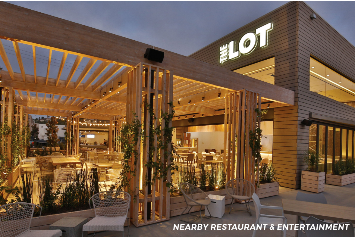
NEARBY RESTAURANT & ENTERTAINMENT