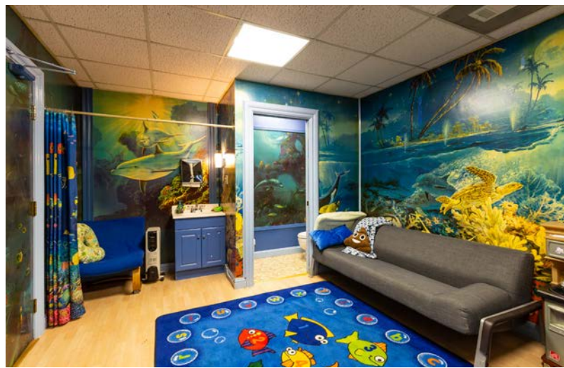
LEFT TO RIGHT Congregation Area // Kids Playroom