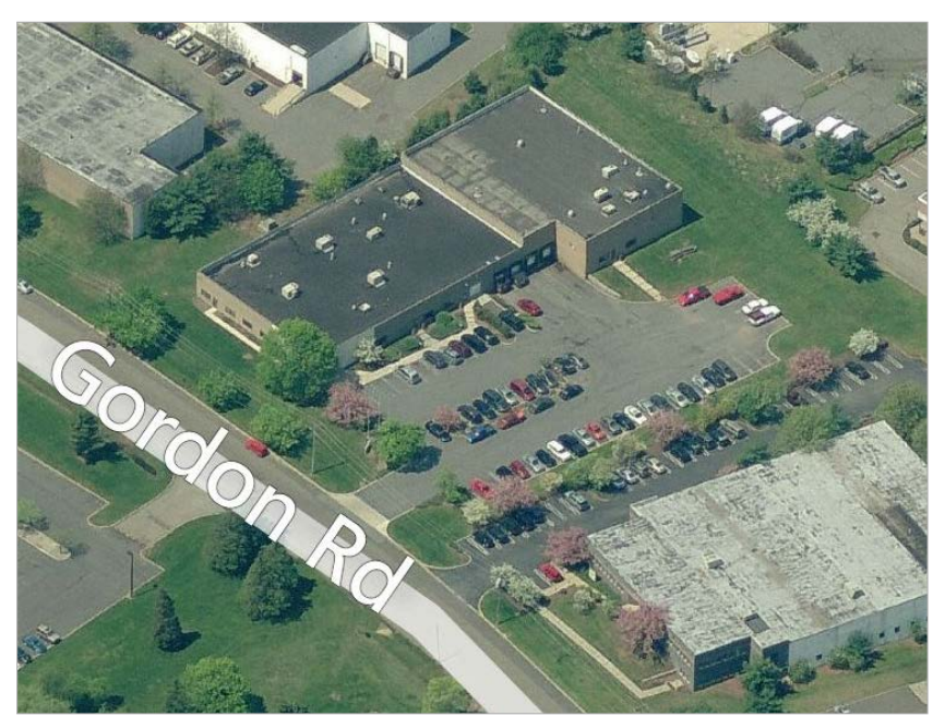
For more information on Exclusive Listing: