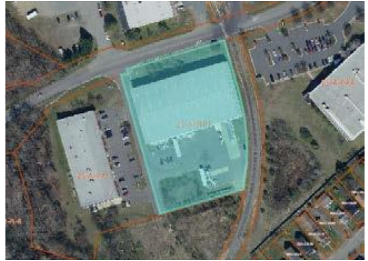
Tax Map 25-A-8HH