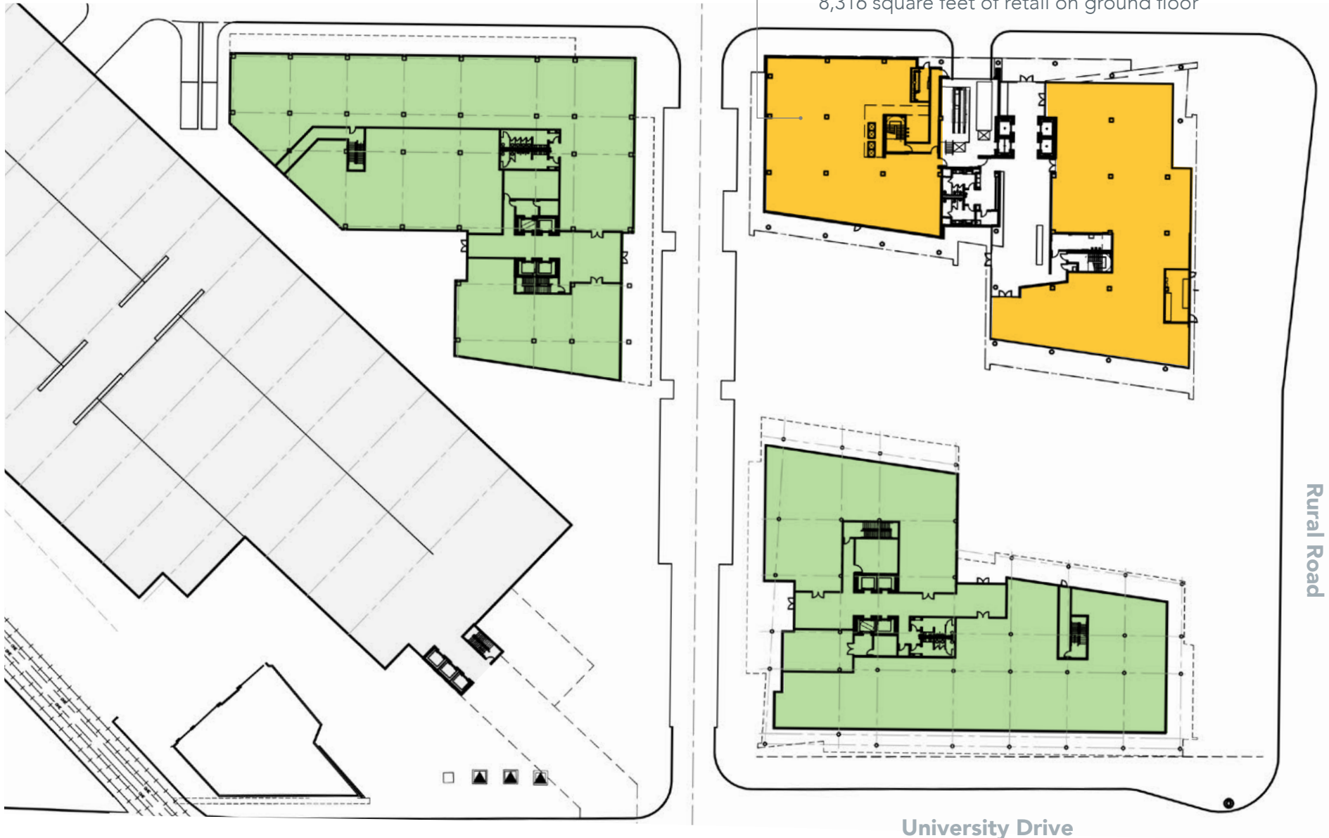
Conceptual site plan

8,316 square feet of retail on ground floor