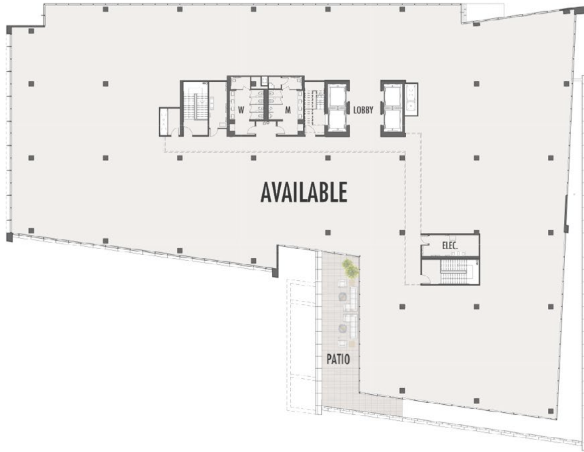
6th Floor Plan