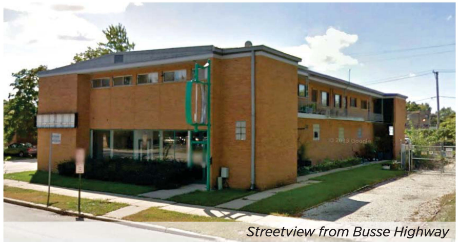
Streetview from Busse Highway