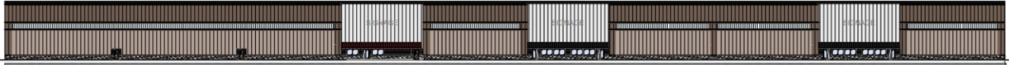
1 FRONT (NORTH) ELEVATION SCALE: 1" = 30'-0"

Industrial Warehouse Available For Lease 90,000 SF