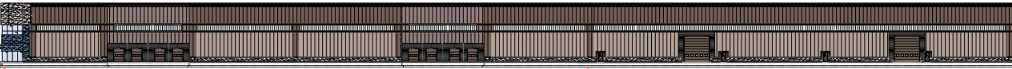
3 REAR (SOUTH) ELEVATION SCALE: 1" = 30'-0"