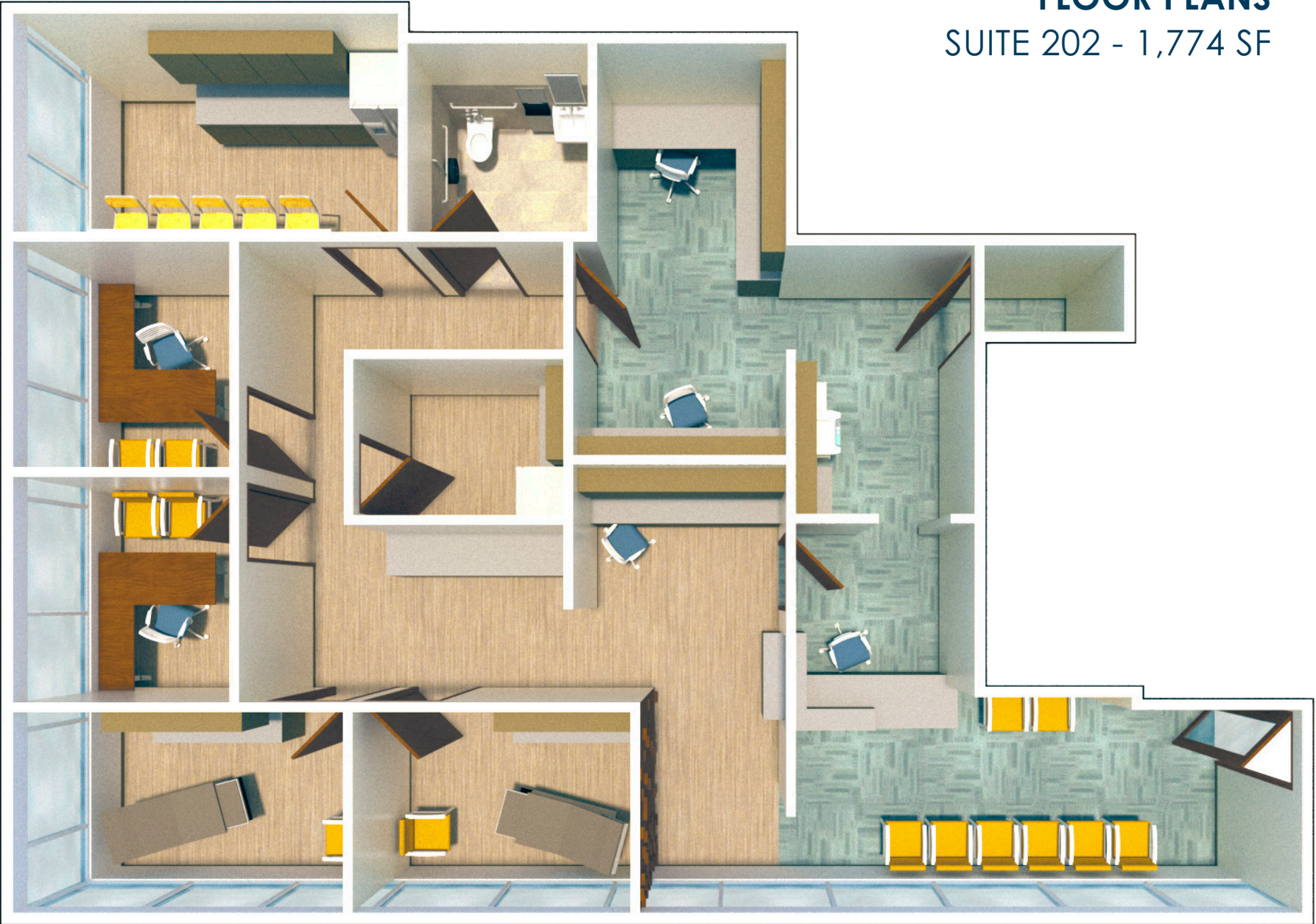
CONCEPTUAL FLOOR PLAN