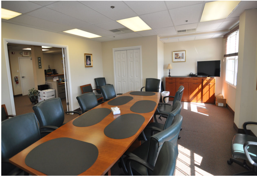
Suite 4 - 1,150± SF