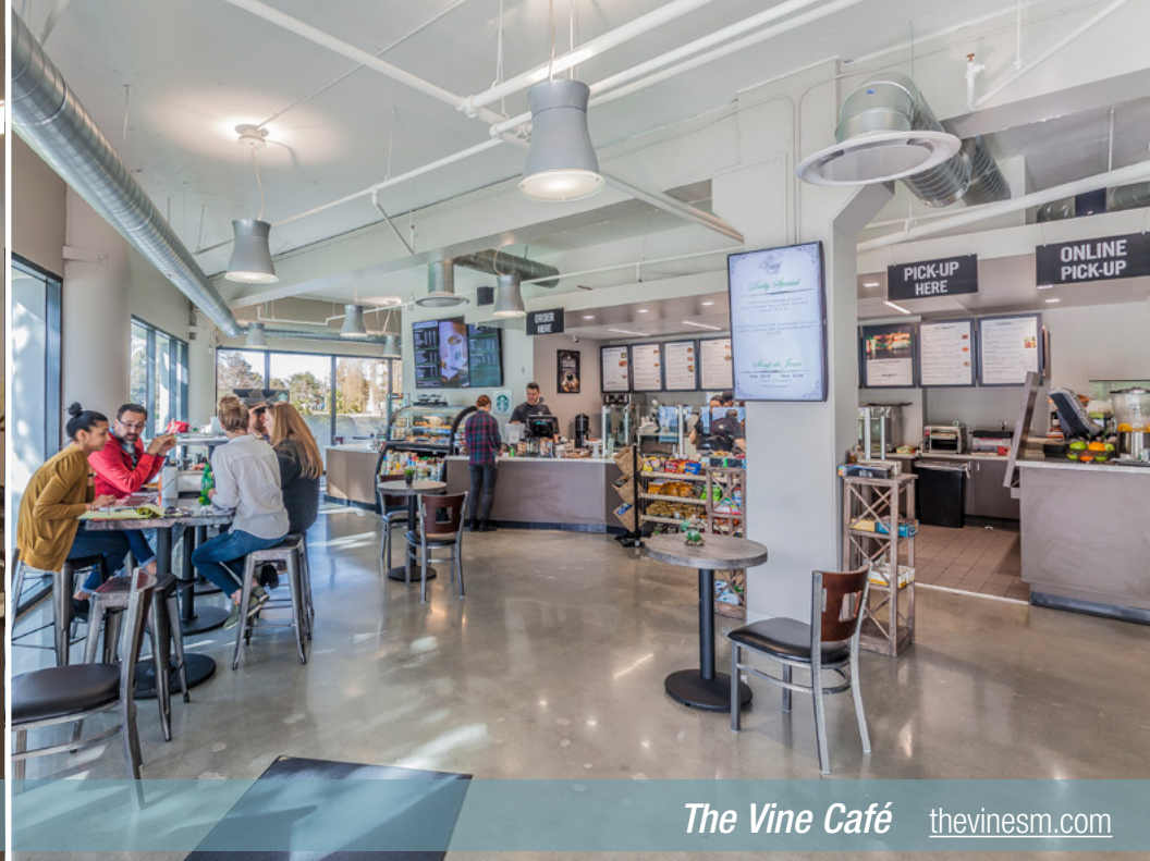
The Vine Café thevinesm.com