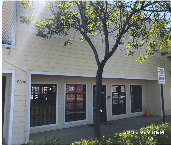
SUITE 969 B&M