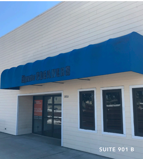
SUITE 901 B