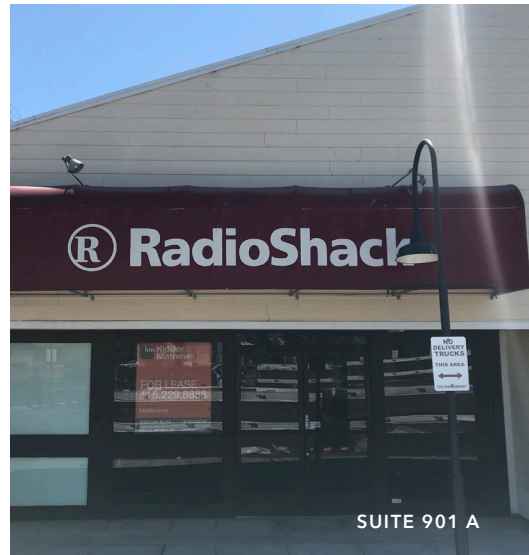
SUITE 901 A