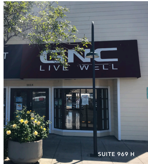
SUITE 969 H

BRAD VAN BLOIS 415.229.8906 brad.vanblois@kidder.com LIC N° 01208137