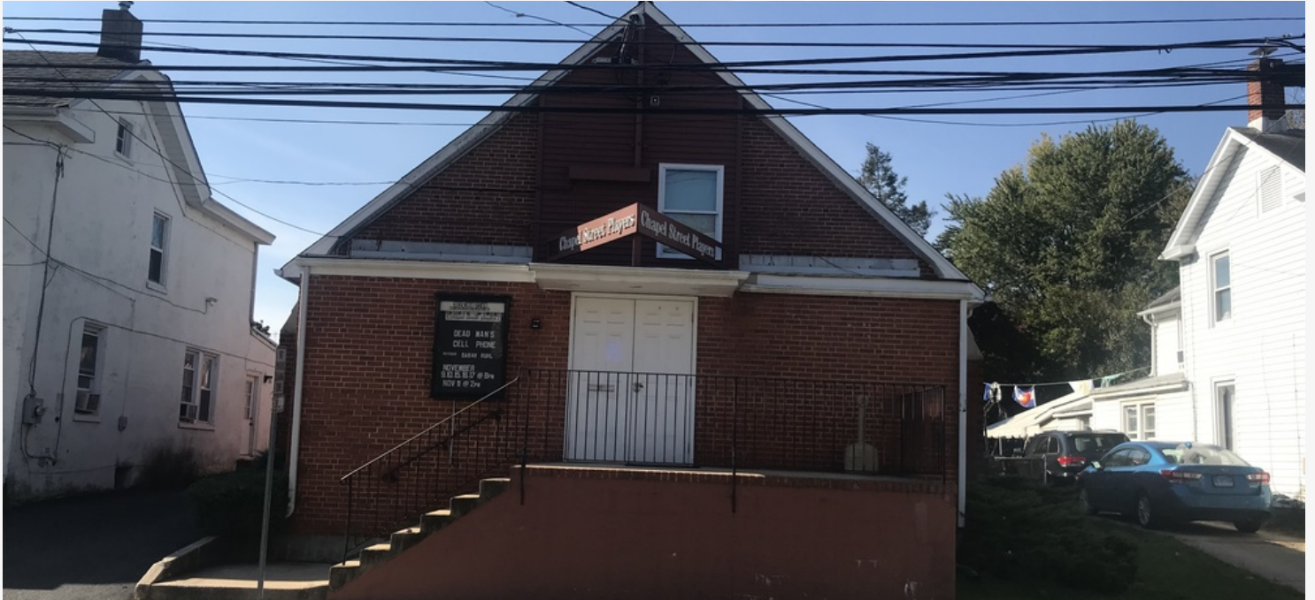
27 N Chapel St. Main Building - Theater