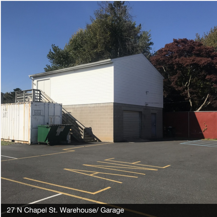
27 N Chapel St. Warehouse/ Garage