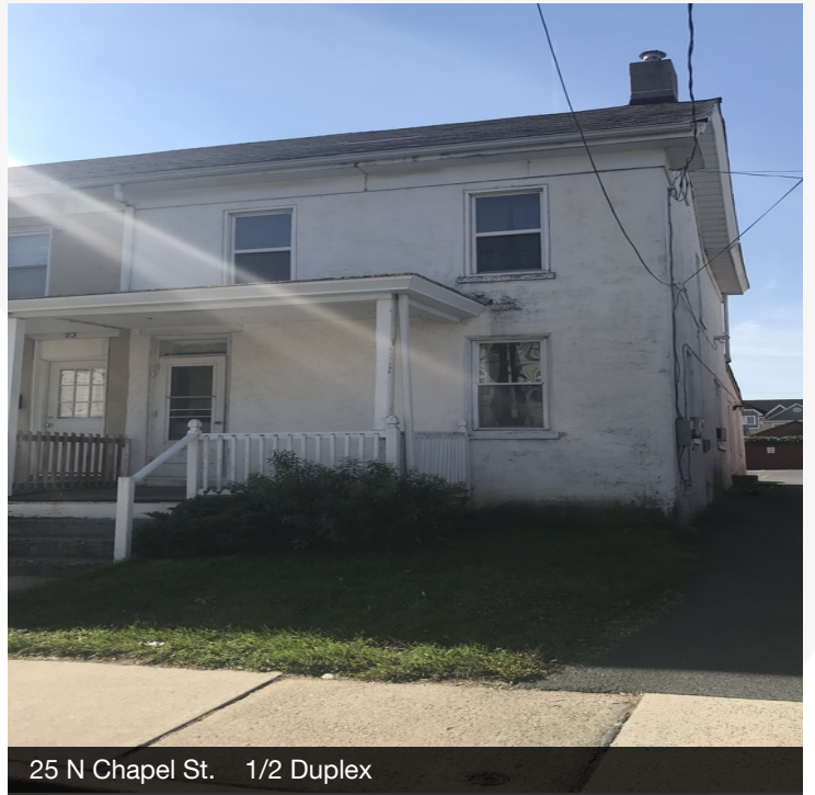
25 N Chapel St. 1/2 Duplex