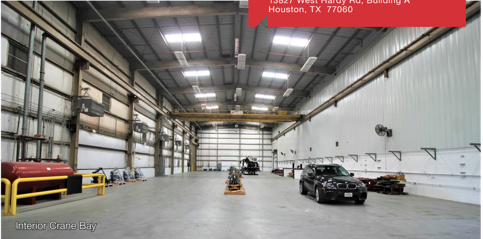
Interior Crane Bay

13827 West Hardy Rd, Building A Houston, TX 77060