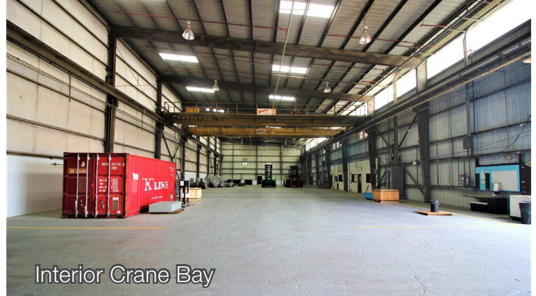
Interior Crane Bay