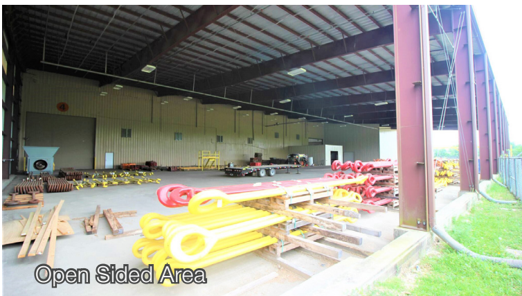
Open Sided Area