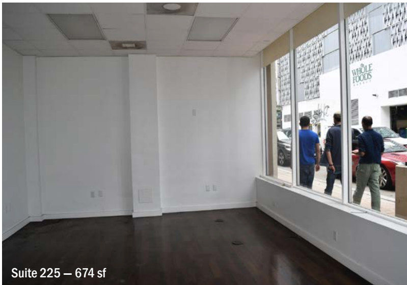
Suite 225 - 674 sf