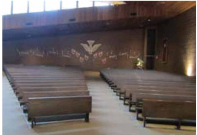
Sanctuary View from Stage