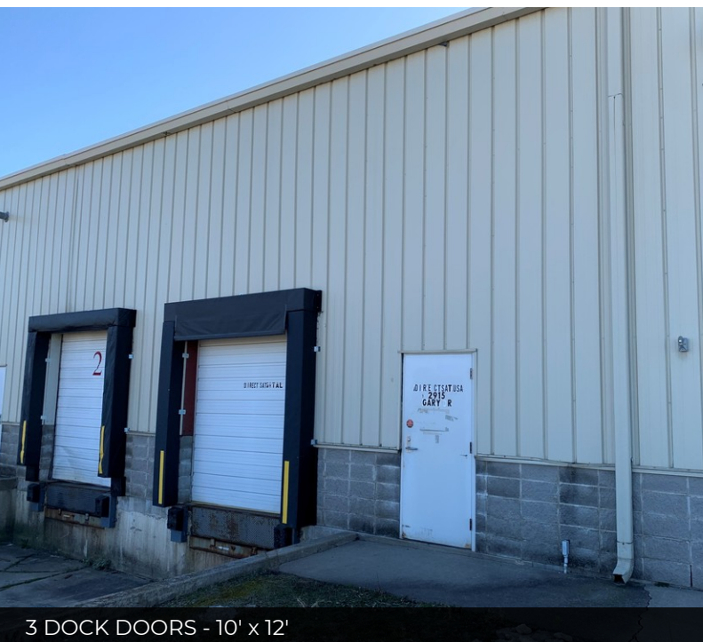
3 DOCK DOORS - 10' x 12'