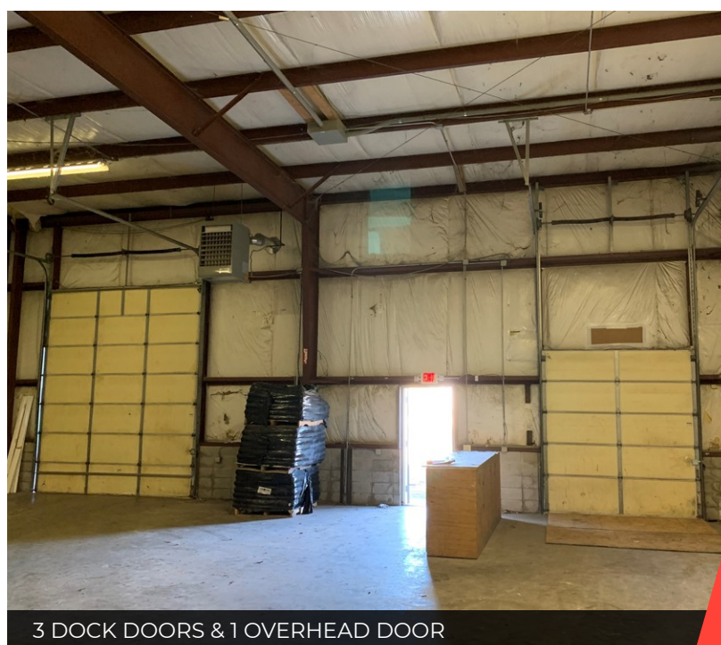
3 DOCK DOORS & 1 OVERHEAD DOOR

KIENAN O'ROURKE 260.450.8443 korourke@xplorcommercial.com