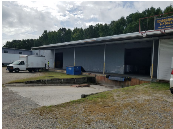
SECTION C LOADING AREA & STEP VAN