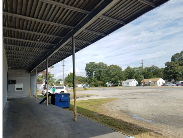
SECTION C COVERED LOADING AREA