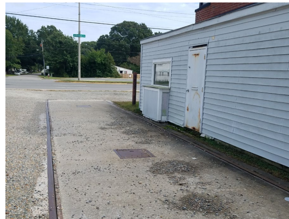
SECTION C 10' x 50' SCALE (Inoperable)