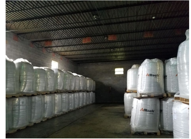
SECTION A 16'2" CLEAR HEIGHT