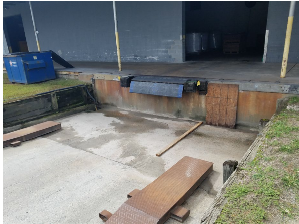
SECTION C LOADING AREA