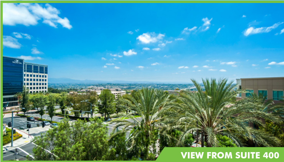
VIEW FROM SUITE 400