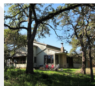
Backyard for Possible Events