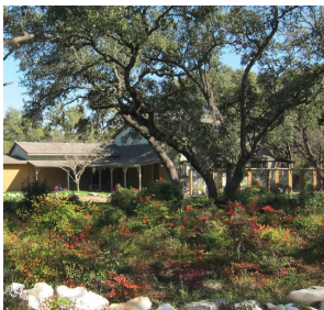
Front Of Office