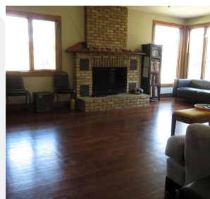
Front Office/Living Room