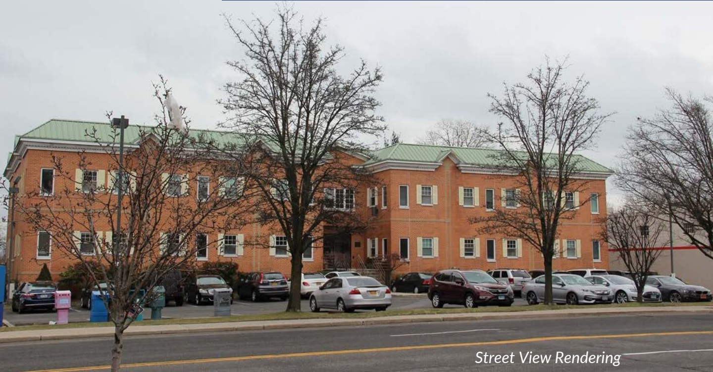
Street View Rendering