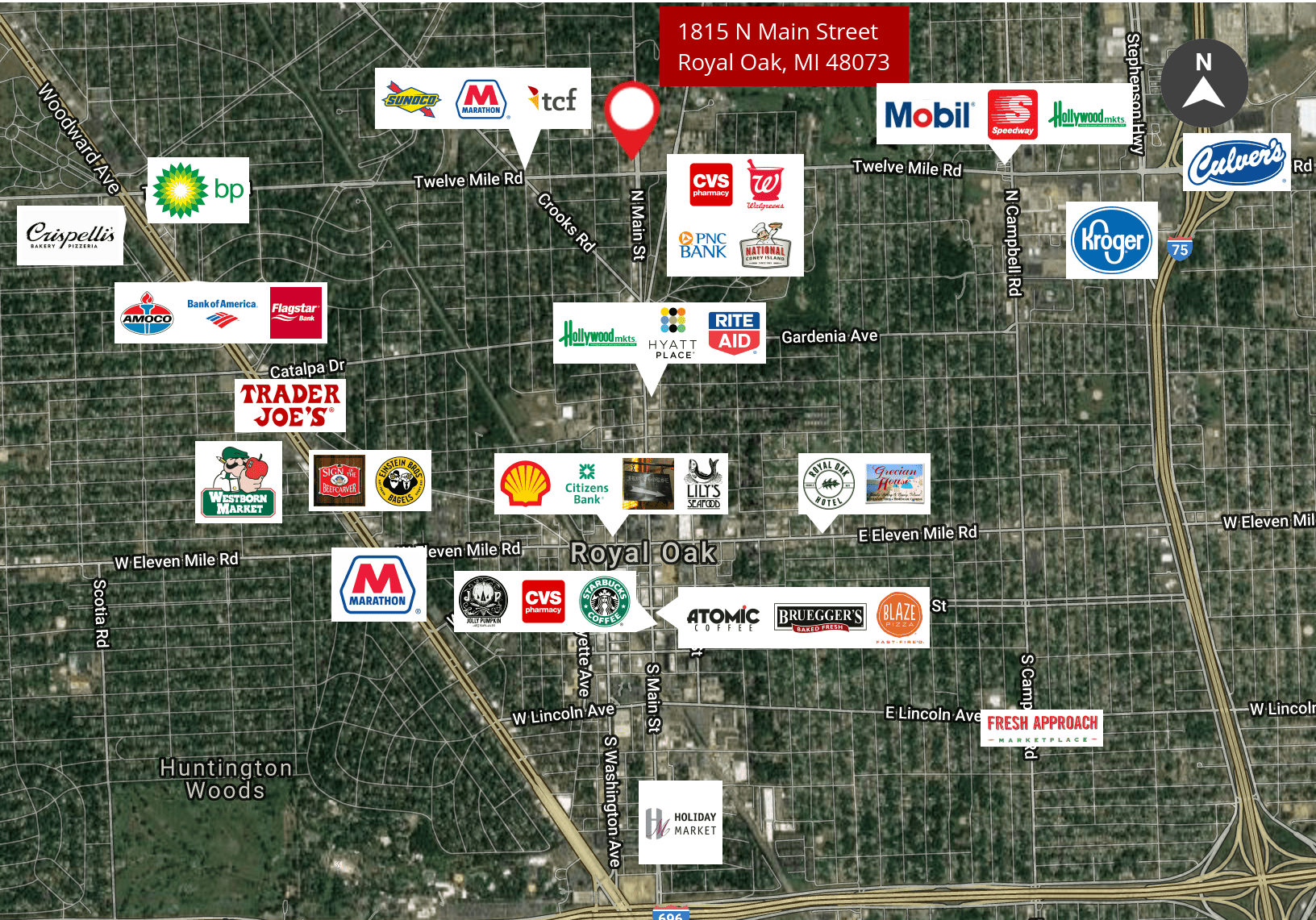
Map data ©2019 Imagery ©2019 , CNES / Airbus, Landsat / Copernicus, Maxar Technologies, Sanborn, U.S. Geological Survey, USDA Farm Service Agency