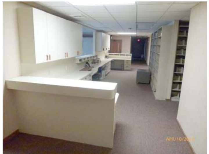
1400 59th St W 138