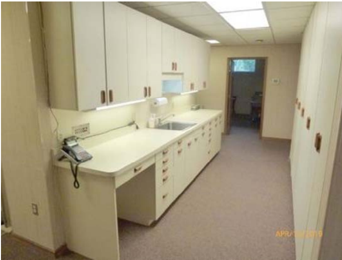
1400 59th St W 142