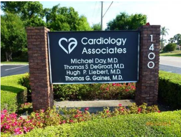
1400 59th St W 011