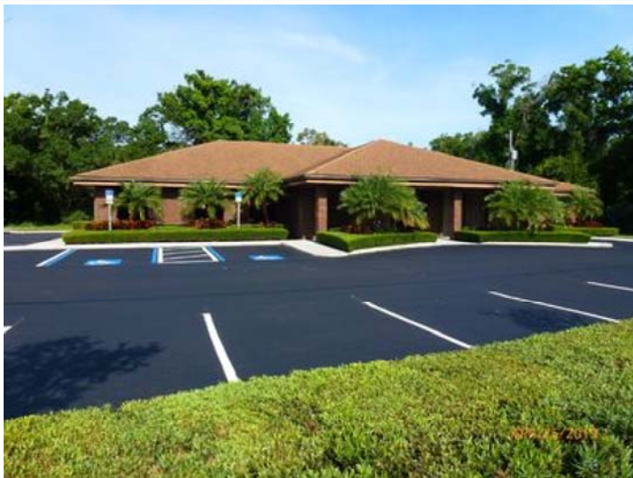
1400 59th St W 001