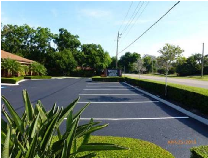
1400 59th St W 005