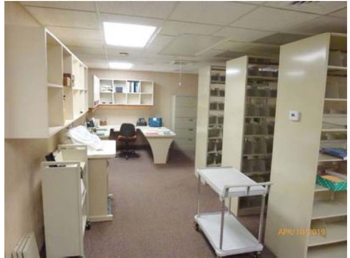
1400 59th St W 145