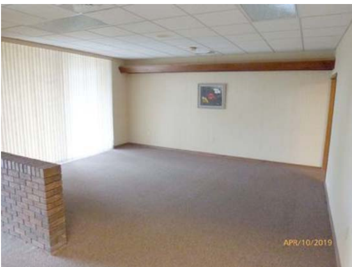
1400 59th St W 134