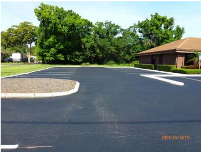
1400 59th St W 006