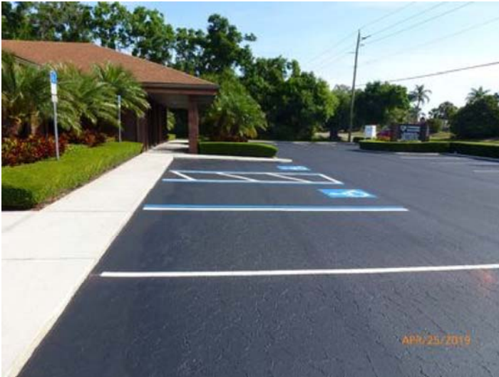
1400 59th St W 010