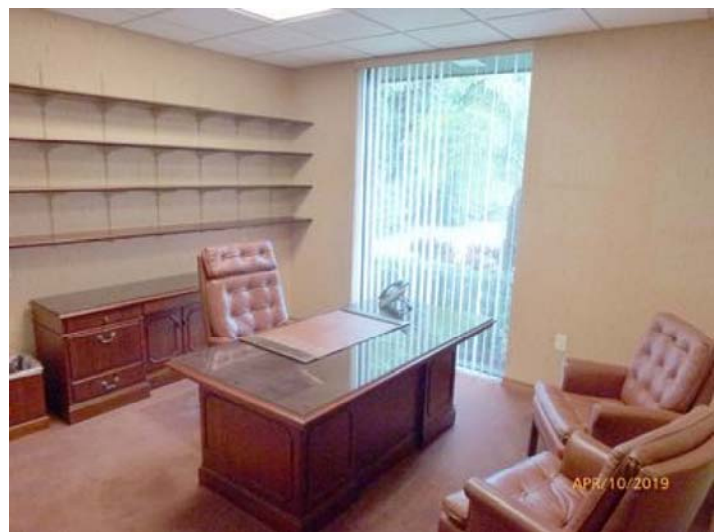
1400 59th St W 141