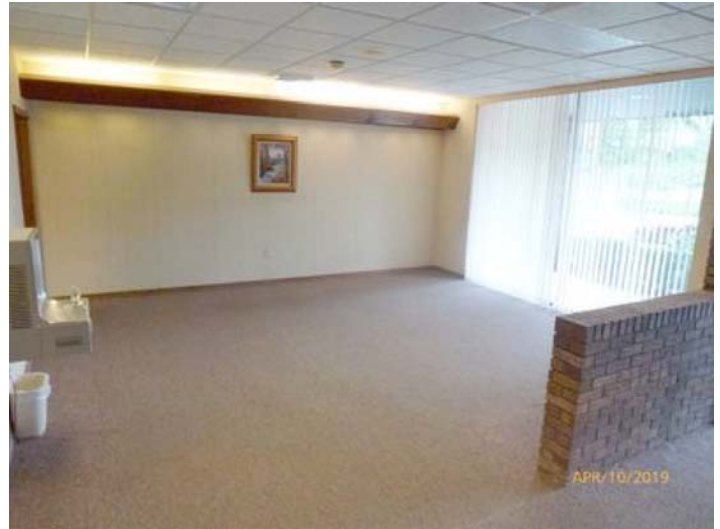
1400 59th St W 135