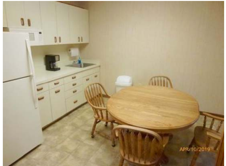
1400 59th St W 143