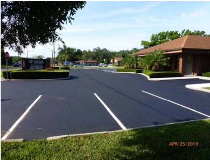
1400 59th St W 004