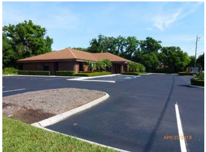
1400 59th St W 009