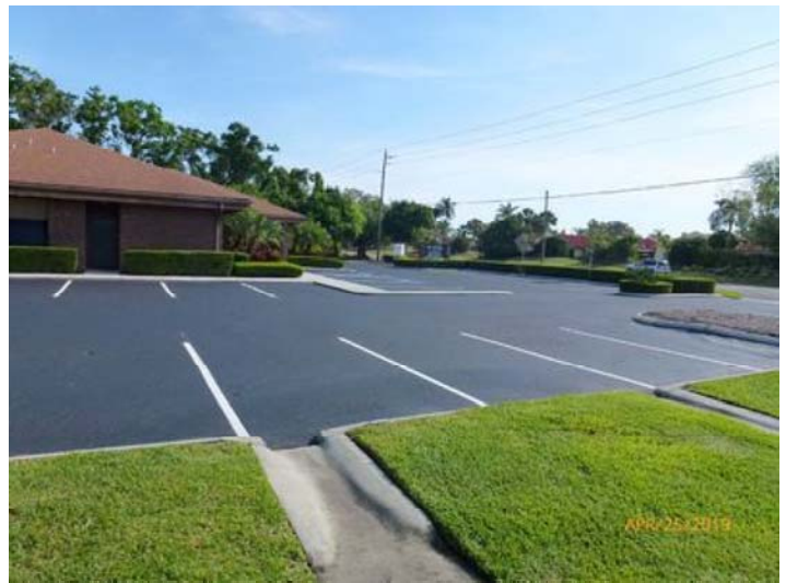
1400 59th St W 008