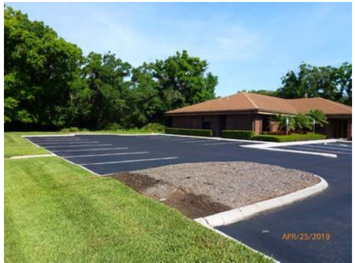
1400 59th St W 007