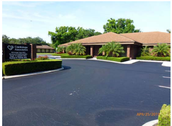
1400 59th St W 003