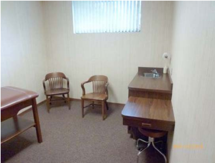
1400 59th St W 140