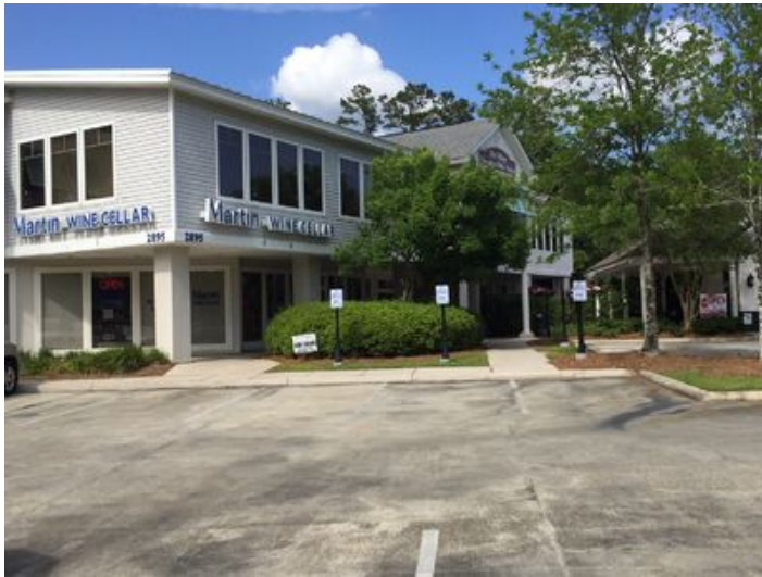
Pelican Village_Pic 2