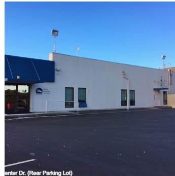
Auto Center Dr. (Rear Parking Lot)