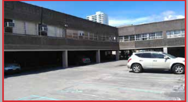
UPPER LEVEL PARKING