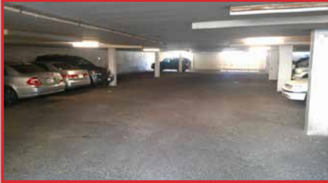
LOWER LEVEL PARKING