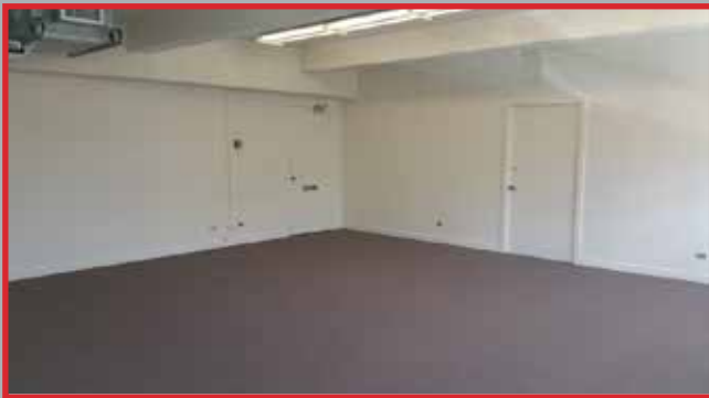
SUITE 25 | INTERIOR PIC