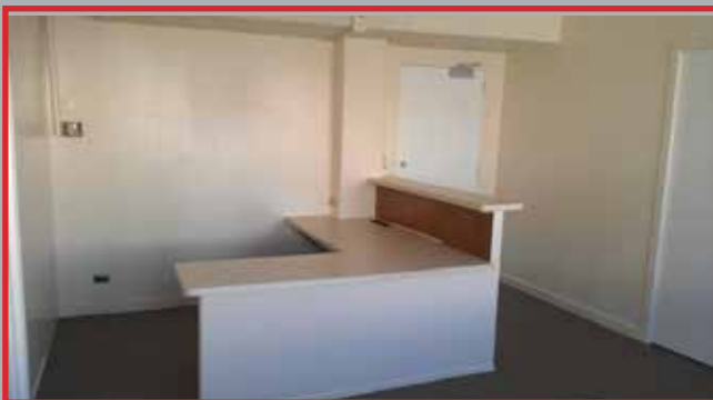
SUITE 29 | INTERIOR PIC