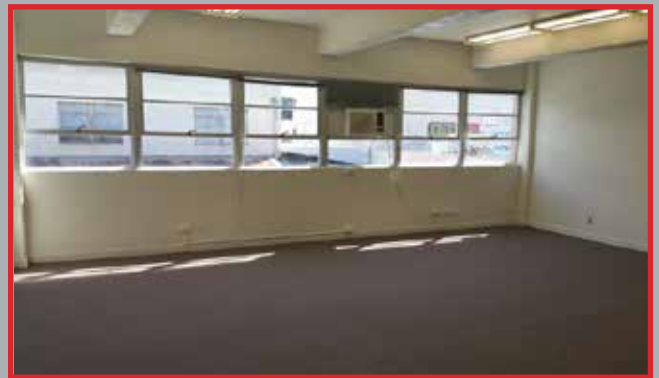
SUITE 25 | INTERIOR PIC 2