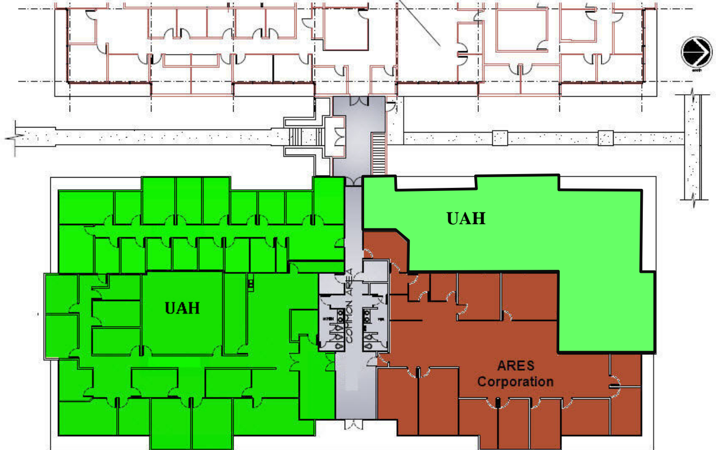
FIRST FLOOR 200 SPARKMAN DRIVE - AS BUILT