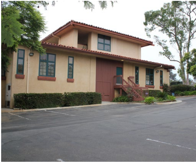
Parking Lot and Staff Entrance