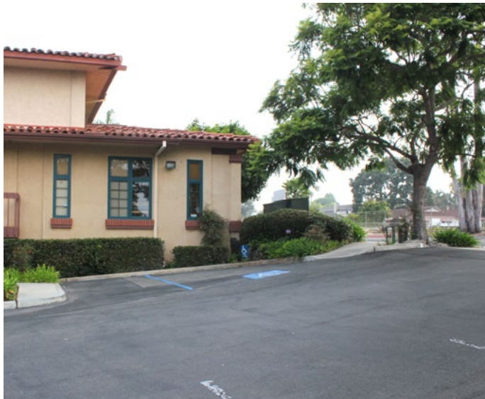
Across from Elementary School