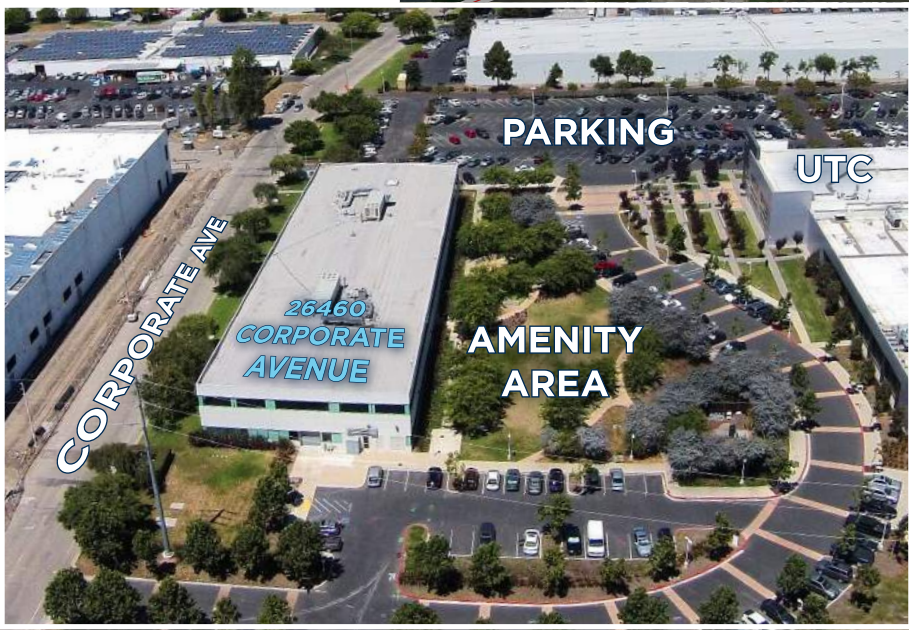
26460 CORPORATE AVE