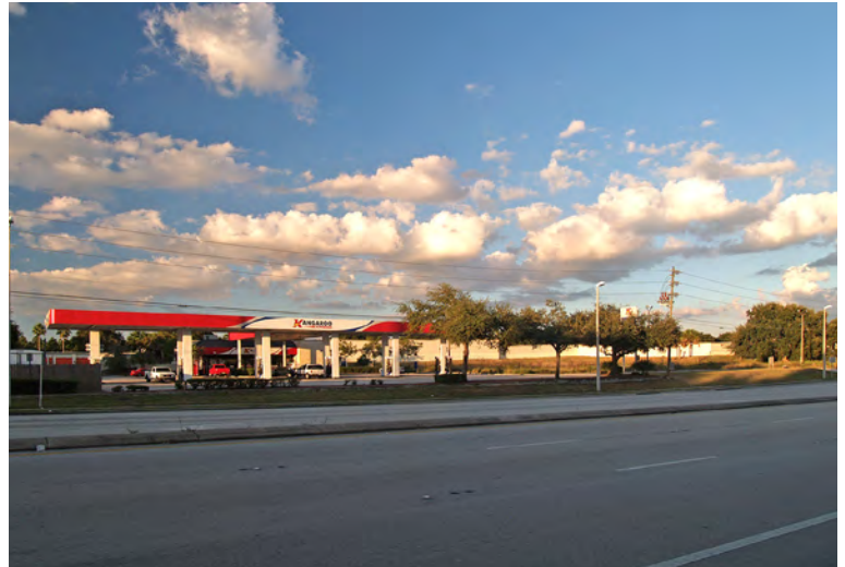
The property to the right of the Kangaroo Gas Station