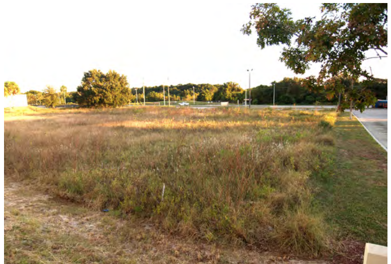
Looking south from the NW corner of the property