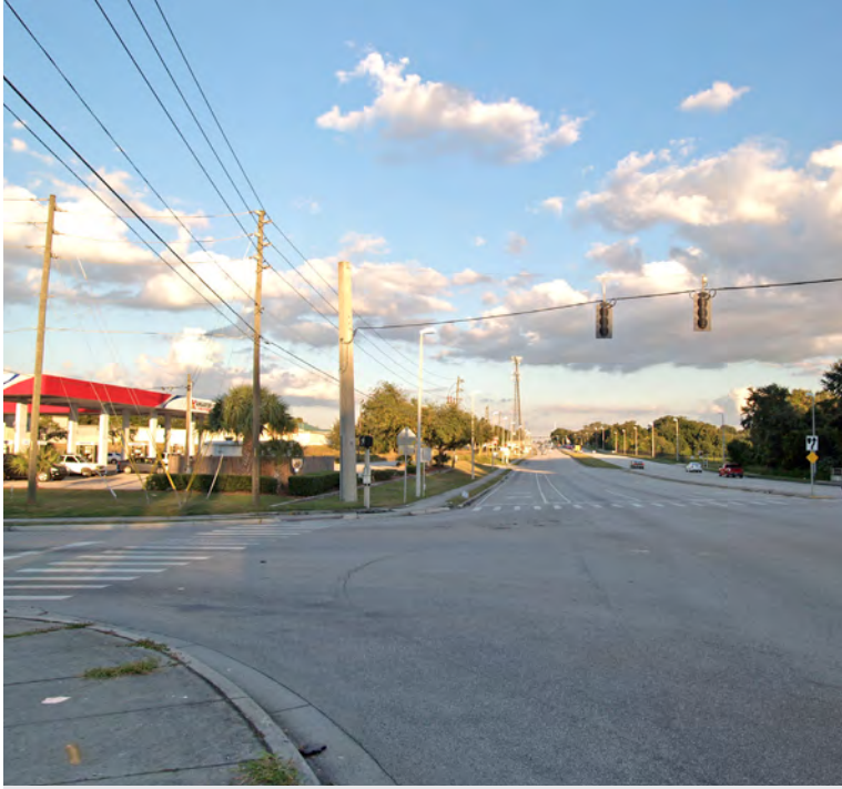
Looking east along Silver Star Road from Lake Stanley Road