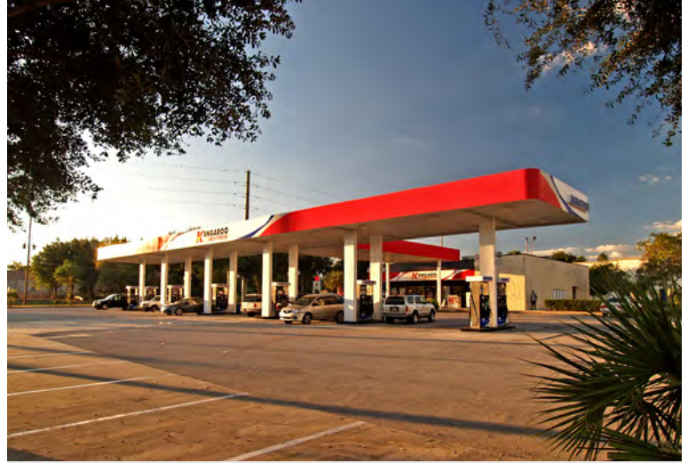
Kangaroo Gas Station between the property and Lake Stanley Road