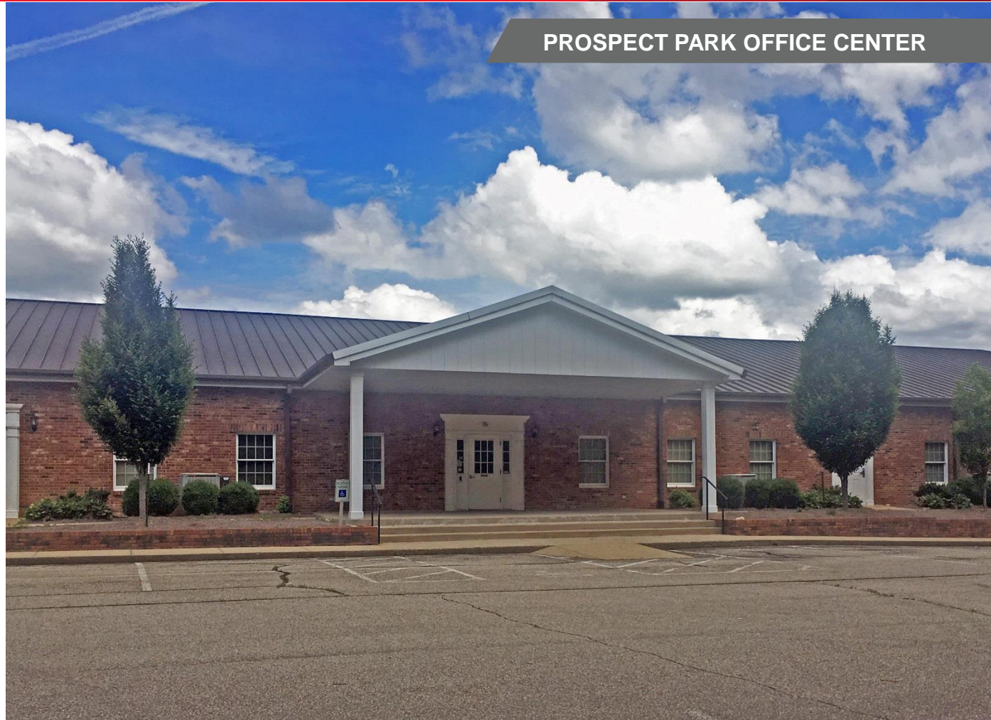
PROSPECT PARK OFFICE CENTER