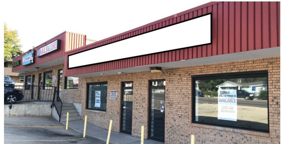
2544 Sheridan Blvd.