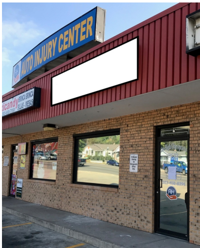
2532 Sheridan Blvd. - Chiropractor Office